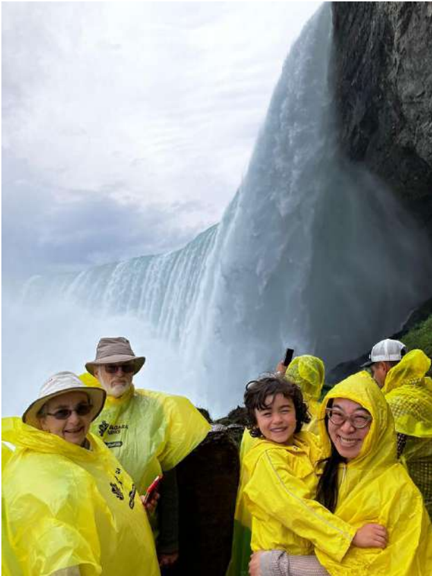
At Niagara Falls