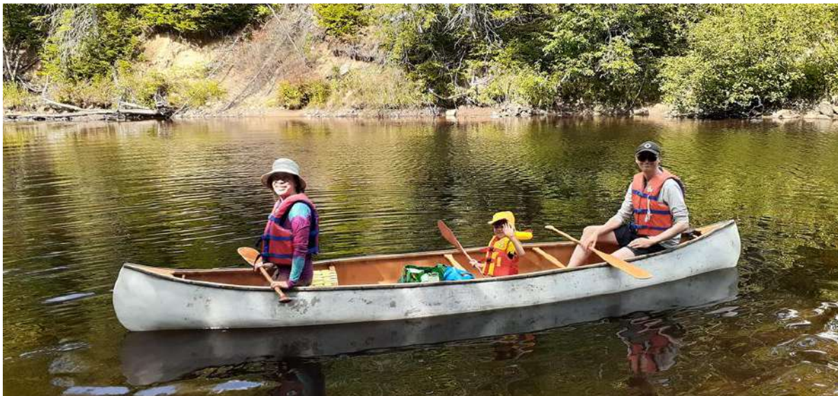
Canoeing the Big East River