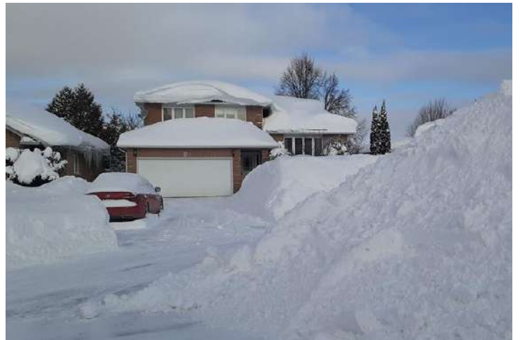
Some of the snow we have had this winter