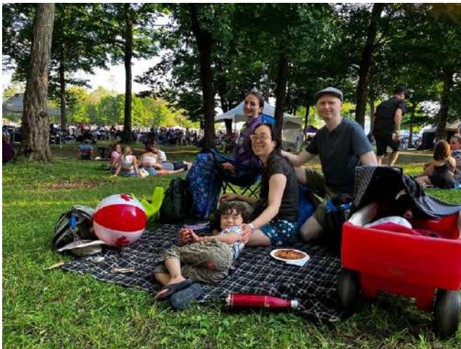
At the Mariposa Folk Festival